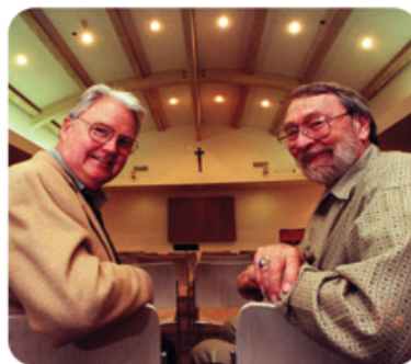
A candidate and his sponsor sit for a photo after an Order of Christian Initiation for Adults (OCIA) class.

I am happy you have responded to the stirrings of the Holy Spirit within you and answered the call to deepen your spiritual practice and journey. The Church needs you. The people of God welcome you. You are beloved among us, and your response in faith is a powerful witness, a reminder to those who may be tempted to take for granted the gift of faith. Thank you. ●