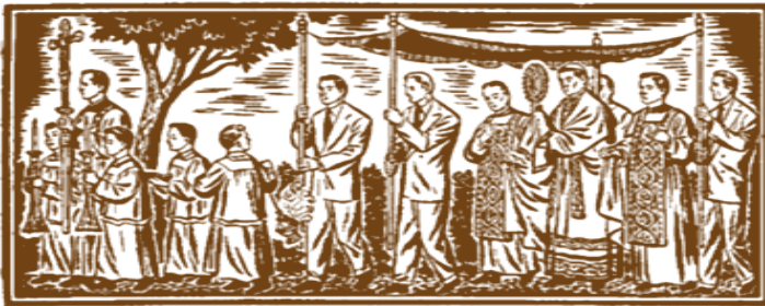
FEAST OF THE CORPUS CHRISTI - THURSDAY AFTER THE TRINITY SUNDAY

For centuries after the celebration was extended to the universal Church, the feast was also celebrated with a eucharistic procession, in which the Sacred Host was carried throughout the town, accompanied by hymns and litanies. The faithful would venerate the Body of Christ as the procession passed by.