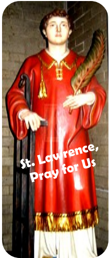
St. Lawrence, Pray for Us