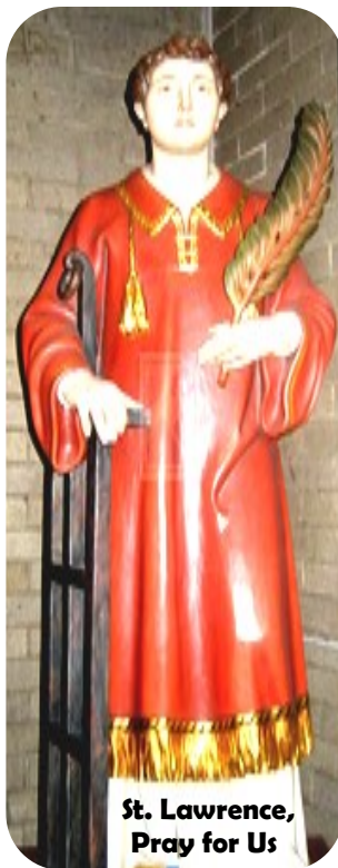
St. Lawrence, Pray for Us