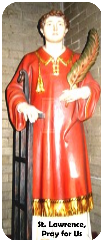
St. Lawrence, Pray for Us